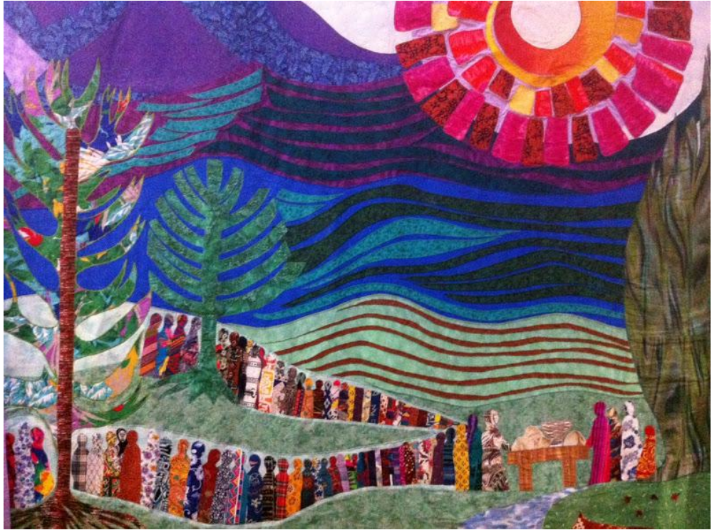
“As the mountains and hills rejoice, the thirsty of all nations are invited to come to the water; the hungry are invited to come to the table. Everyone is welcome.”