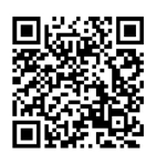
All Are Welcome at the Table